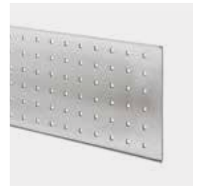
Window module stainless stalle + adapter profile