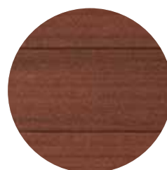
Area set Chestnut Brown (multicoloured)