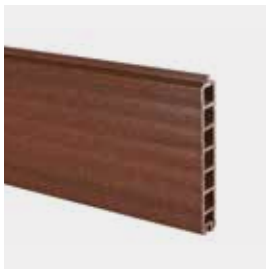
Slat in all colours