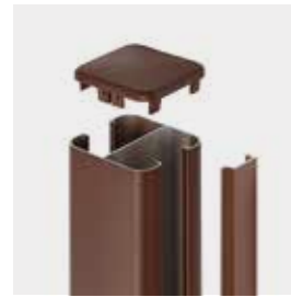
Ground post Effective in Brown und Anthracite