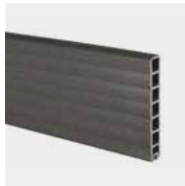
Top slat in all colours