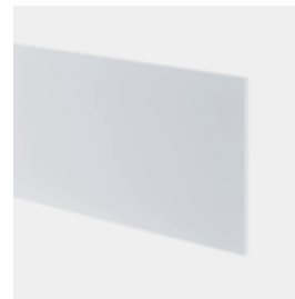
Window module Acryl + adapter profile