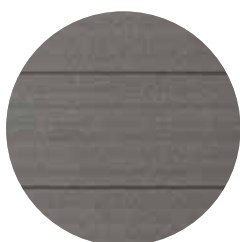
Area set Titanium Grey (monochrome)