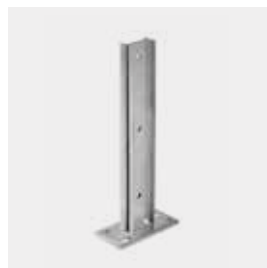
Ground anchor Effective