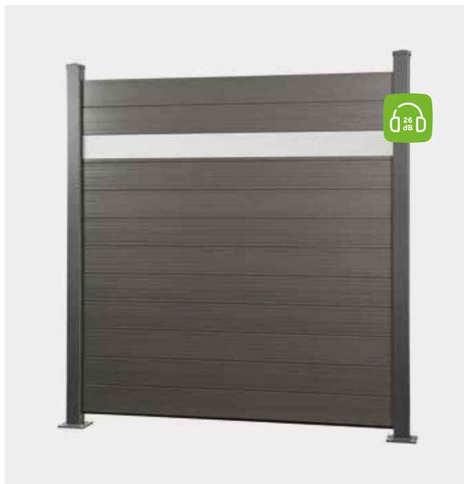
Posts in Anthracite, Area set in Titanium Grey, Additional accessories: Window module in Acryl