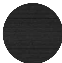
Area set Anthracite (monochrome)