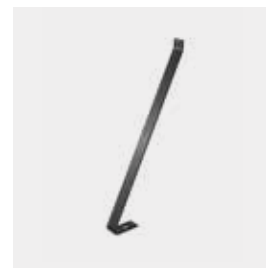
Wind anchor Effective