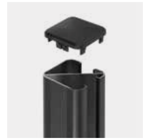
Corner post Effective in Brown und Anthracite