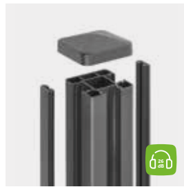
Post Flexible in Anthracite