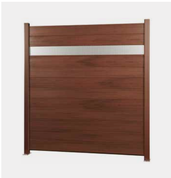
Posts in Brown, Area set in Chestnut Brown, Additional accessories: Window module in stainless steel